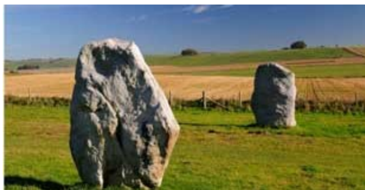
West Kennet Avenue, looking towards the Ridgeway

A feasibility study was successfully completed in April 2010, generously funded by grants from the Sustainable Development Fund of the North Wessex Downs Area of Natural Beauty, the LEADER fund of the Plain Action Local Action Group and by Wiltshire Council's Rights of Way Department.