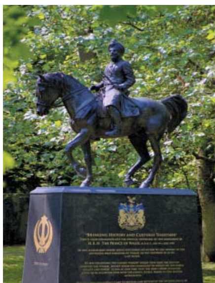
The statue of the Maharajah Duleep Singh on Botten Island on the Little Ouse, Thetford

Here is a little more to tempt members to join the walk to be led around the town in April. The walk leader may not include this very remarkable statue on his walk, but it is worthy of note nonetheless. For this statue, located close to the Icknield Way at the end of the Thetford Link, commemorates the life of the first Sikh to settle in Britain. The Maharajah Duleep Singh became the last Maharajah of the Punjab in 1843 aged 5 but, following the annexation of the Punjab by the British government in 1849, he resigned his colonial rights and came to Britain to become a favourite of Queen Victoria. In 1863, with money from the British government, he bought the Elveden Estate near Thetford. This 17,000 acre estate allowed him to live the extravagant life of an English country gentleman, developing quite a reputation as he did so! With two wives and several mistresses he produced three princes, three princesses and probably a number of other children, not all of whom survived to adulthood. But it is his second son Prince Frederick who fell in love with Norfolk and became a historian. The Prince was a great benefactor of Thetford and in 1921 he purchased the Ancient House, a 15th century merchants house to give to the town as a museum.