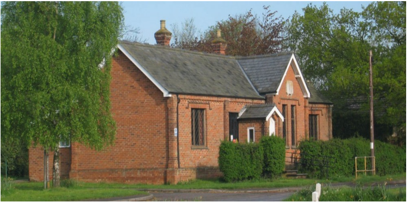
Burrough Green Reading Room