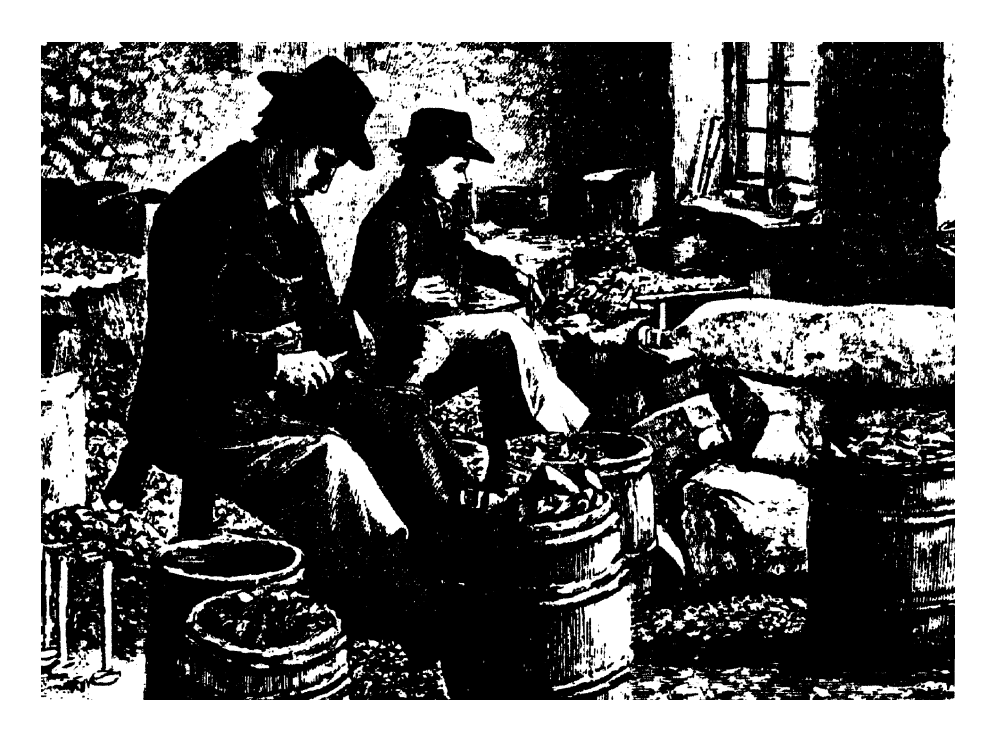
'Masters of Flint' - an 1876 engraving