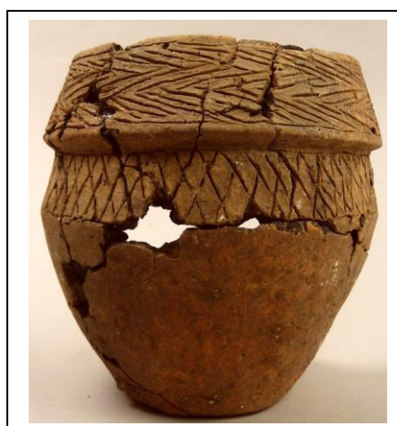
The miniature collared urn excavated in 2012

One of the most remarkable aspects of the Norton henge is that we know a lot about contemporary activity in its vicinity. A few hundred metres to the south-west of the henge is Blackhorse Road where Neolithic and later occupation was identified beside the Icknield Way in